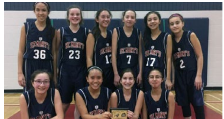
Flames Blue Fire, Consolation Champs in the George Waters Middle School Invitational